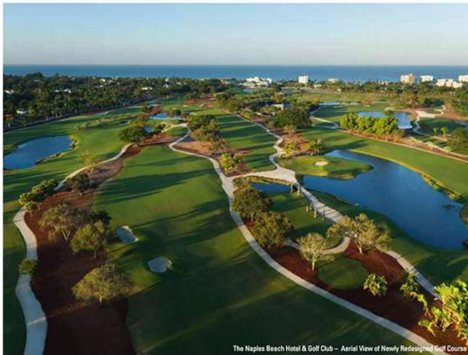
The Naples Beach Hotel & Golf Club – Aerial View of Newly Redesigned Golf Course

For more information about The Naples Beach Hotel & Golf Club, or to make a room reservation, visit NaplesBeachHotel.com or call (800) 237-7600 or (239) 261-2222.