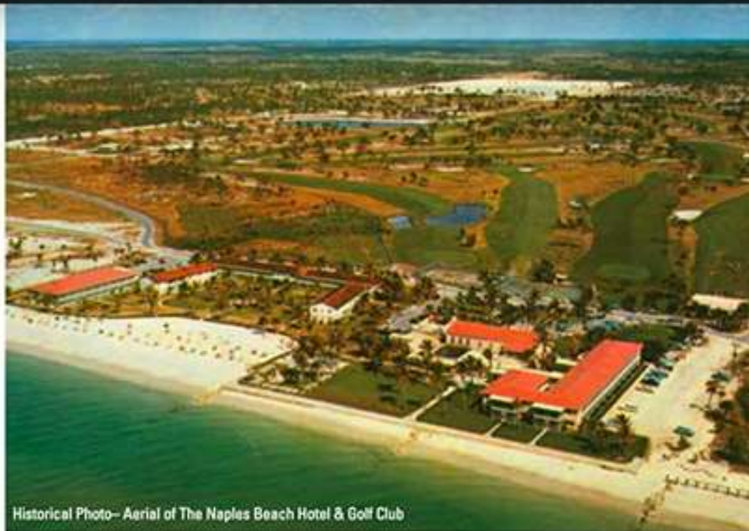
Historical Photo— Aerial of The Naples Beach Hotel & Golf Club

The overall golf experience at The Naples Beach Hotel & Golf Club is complemented by the presence of a